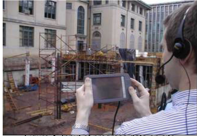
Figure 4, Input of progress data on site

To support the process of identifying an element and navigating to it, ICMMS has a zoom and a scroll function that can be controlled via speech input and via the touch screen. Upon clicking with the stylus on the background of the drawing, a dialog box appears that has the 2 buttons to zoom in and zoom out on a drawing. Scroll functionality is provided by the scroll bars of the drawing. It is important for the ease of use of the system to access scroll and zoom functions quickly. The limited size of the screen of the wearable computer makes it necessary to take special care of the accessibility of all elements, whatever scale they are, in a drawing.