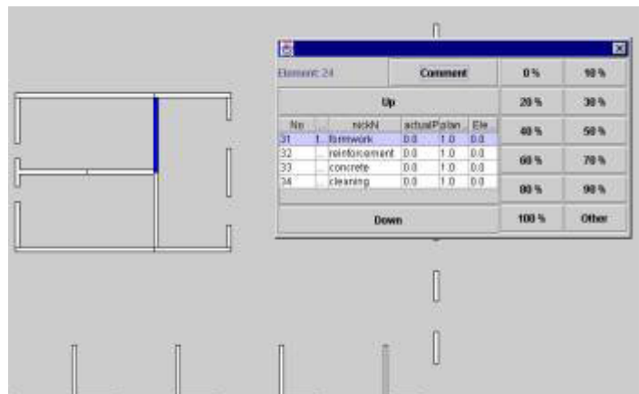
Figure 3, User interface for progress input

Using a more sophisticated 3D graphical interface could make the entire process of picking elements and navigating through a drawing more difficult and therefore inefficient to be done on a wearable computer. The geometry data of the depicted elements is read from a dxf - file into the database. Reading this data from the database the Field Client draws the elements as filled polylines, which is accurate enough to be recognized by the user. In future versions of ICMMS, a more elaborated concept may replace this approach.